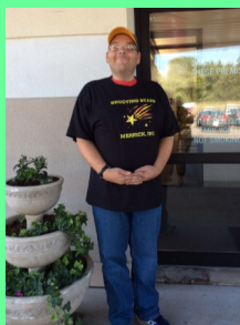
This is where I work; it's a beautiful Day :)

I like to walk, chill out, and watch movies.