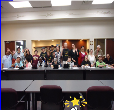
Taking a picture of Shooting Stars Group— big happy family