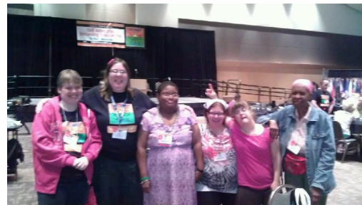
The Lady's at the SABE Conference