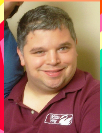
Just hanging out with smile