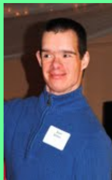
At the Holiday party Having fun